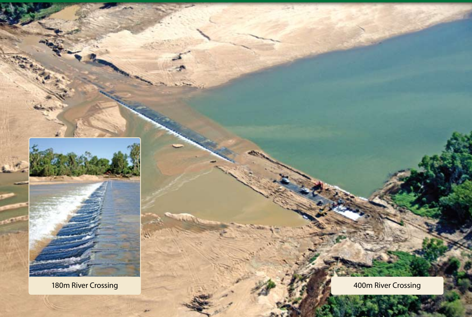
180m River Crossing